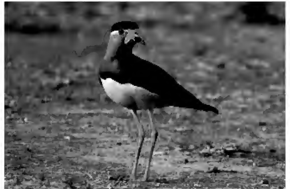
Yellow-wattled Lapwing Vanellus malabaricus They are found in drier parts and are not as dependent on the proximity of water as their cousins, the Red-wattled Lapwing.